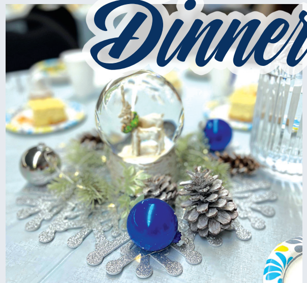
"Snow What Fun" we had at the LiNK Holiday Dinner.